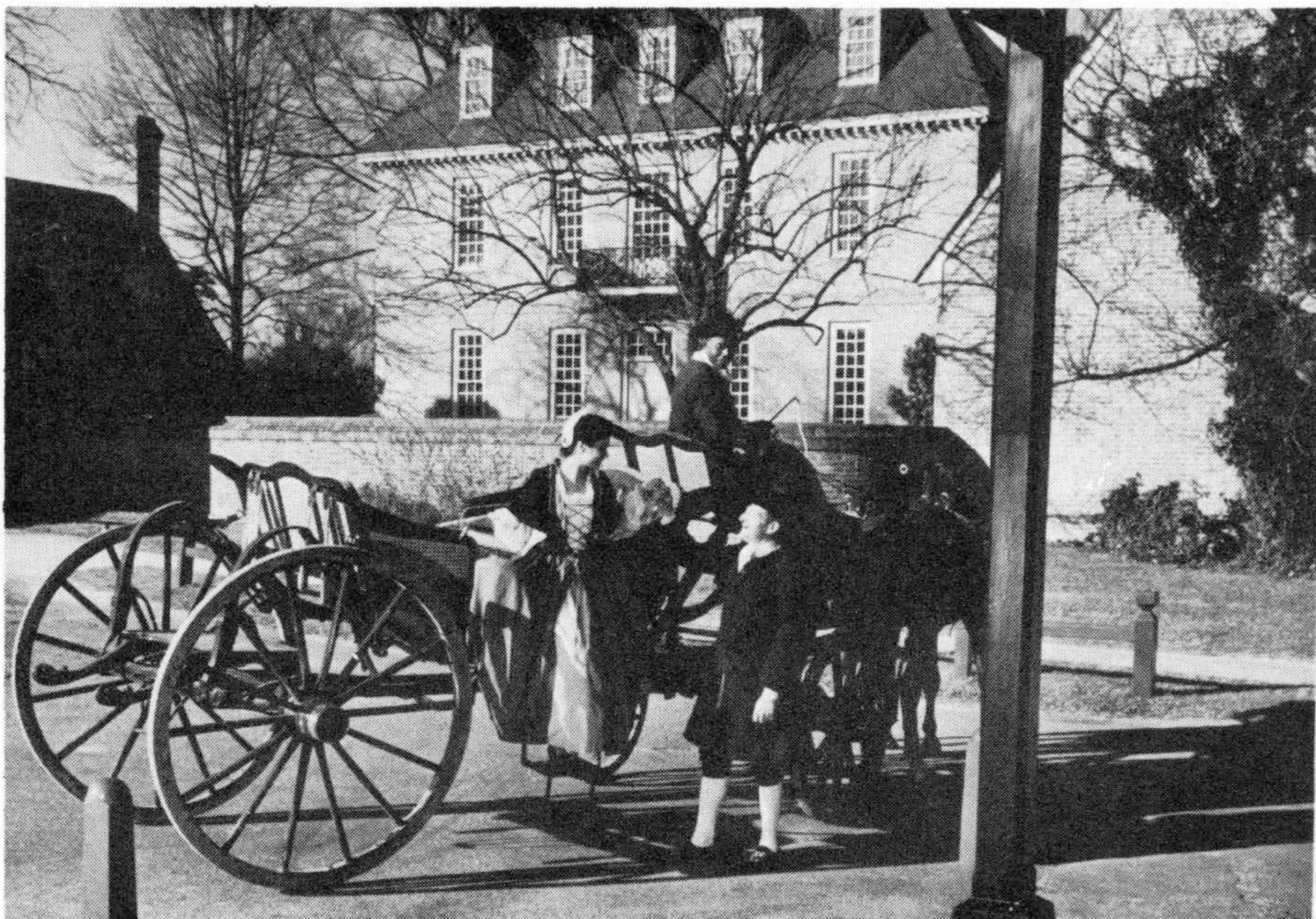
As part of the restoration of 18th century Williamsburg, hostesses, guardsmen, craftsmen and other Colonial Williamsburg personnel wear 18th century dress. A hostess is alighting from an 18th century carriage in front of the reconstructed Governor's Palace.

In the course of their five year study, they have found that traffic noise is louder and more objectionable than industrial area noise to which people most often object. Motor coaches are not the most annoying noise source but only seems so since they operate on boulevards that are otherwise quiet.